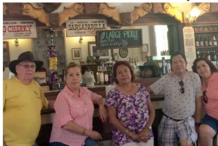
Our Family from Mexico, Columbia, CA