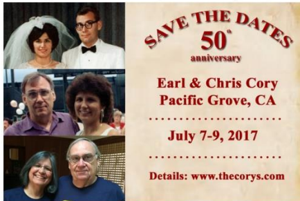
50th Anniversary, Pacific Grove, CA