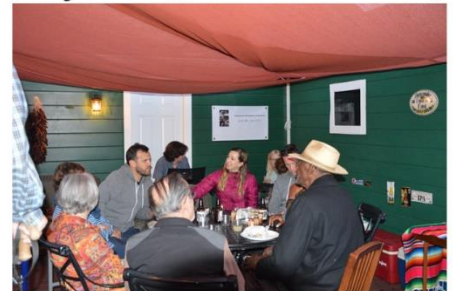
Friday Bar-B-Que at 50th Party