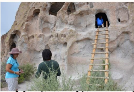
Bandelier National Monument, NM