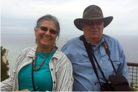
Mackinac Island, MI