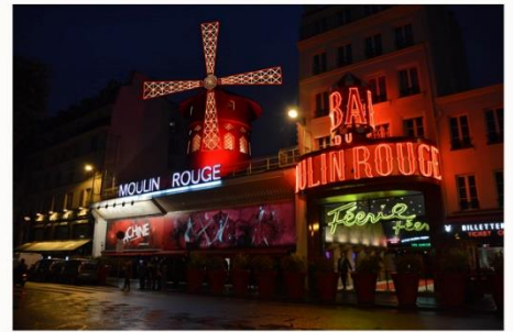
Paris at Night