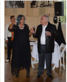
Welcome to The Party