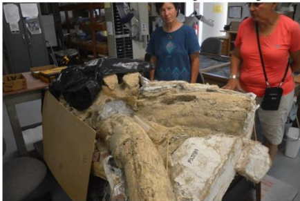
Mammoth Fossils in Anza Borrego