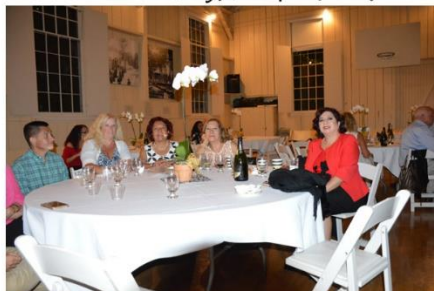
Friends & Relatives at 50th Party