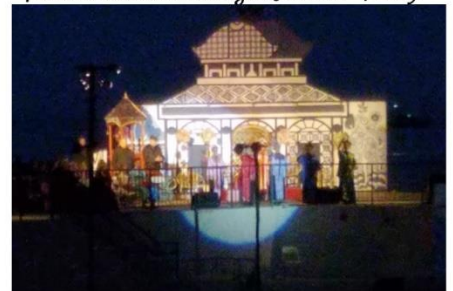
Feast of Lanterns, July, Pacific Grove, CA