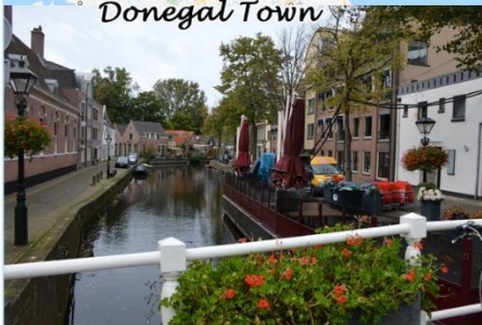
Edam, North Holland, NL