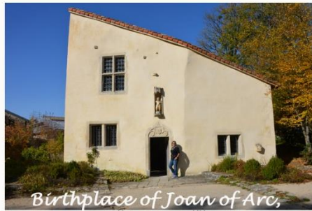
Birthplace of Joan of Arc, Domrémy-la-Pucelle, France