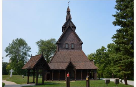
Stave Church, MN