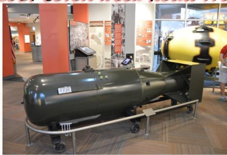
Little Boy & Fat Man, NM