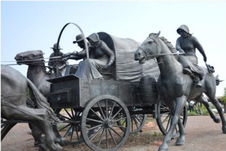
Land Run Monument, OK