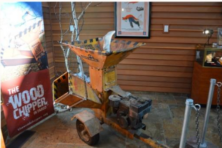
Wood Chipper, Fargo, ND