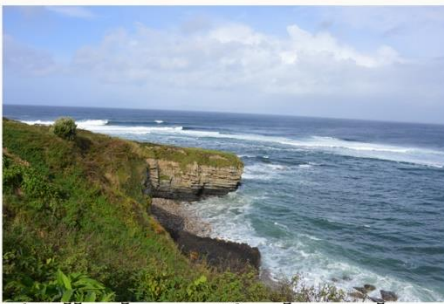
Mullaghmore Head, Co. Sligo