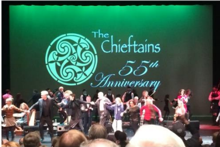
Chieftains 55th Anniversary, Carmel, CA