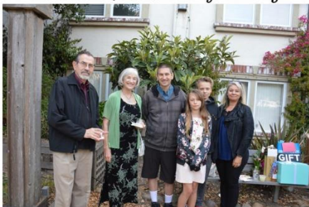
The Gregor Family at 50th Party