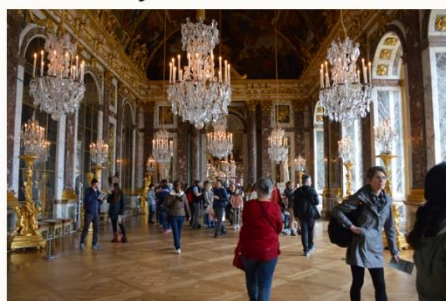
Hall of Mirrors, Versailles