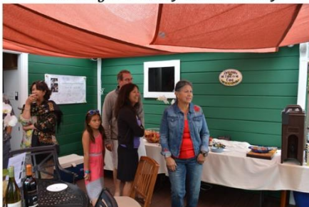
Sunday Brunch at 50th Party