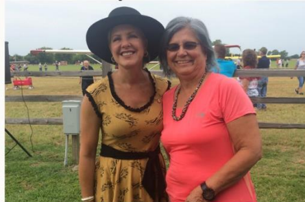
Will Rodgers Fly-In, OK