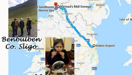
Benbulbin Co. Sligo