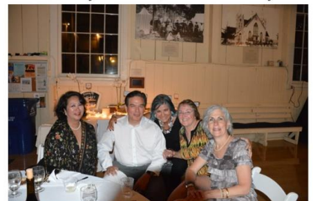
Former Work Colleagues at 50th Party