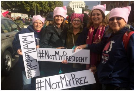
Women's March, Oakland, CA