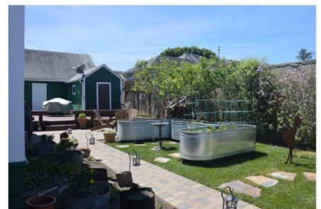
Raised Gardens, Pacific Grove, CA