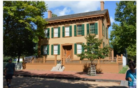
Lincoln Home, Springfield, IL