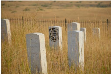
Little Bighorn Battlefield, MT