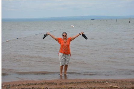
Lake Superior, MN