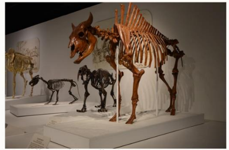
Panhandle Plains Museum, TX