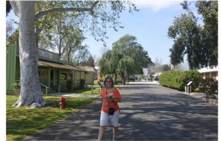
Kern County Museum, Bakersfield, CA