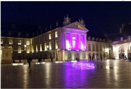
Palais des Ducs, Dijon, France