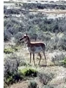
Pronghorn in NV