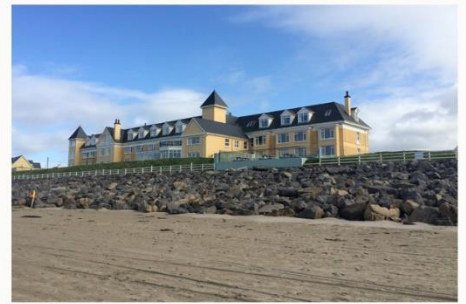
The Sandhouse, Co. Donegal