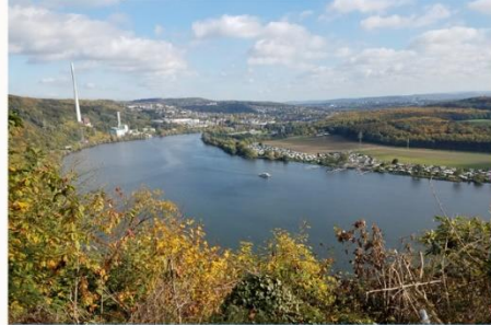
Der Ruhr, Herdecke, Germany