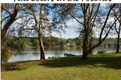
Delaware River Crossing, PA to NJ