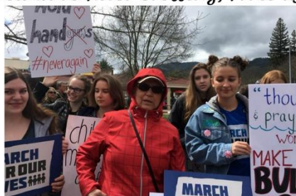
March For Our Lives