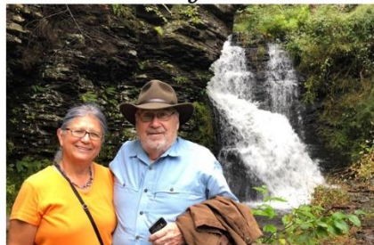
Bushkill Falls, PA