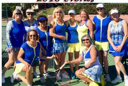
Chamisal Tennis Team