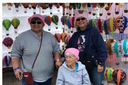
Havasas Hot Air Balloon Festival