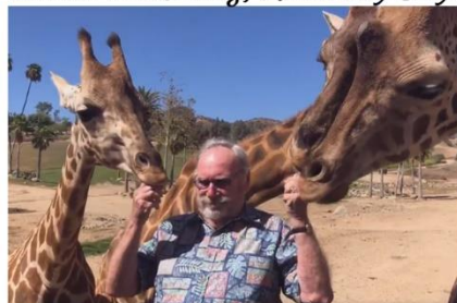
San Diego Wild Animal Park