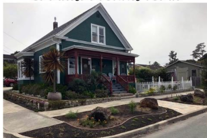
Front Landscaping Finished