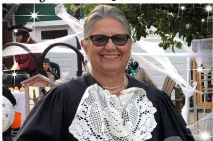
Notorious RGB CLC