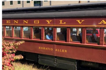
The Stourbridge Line, PA