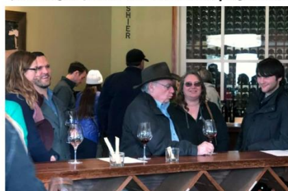
Wine Tasting in Sonoma