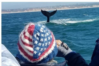
Whale Watching, Monterey Bay