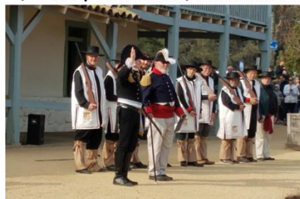
The Burning of Monterey - 1818