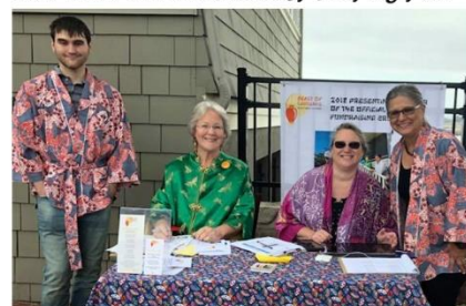
Feast of Lanterns Fundraiser